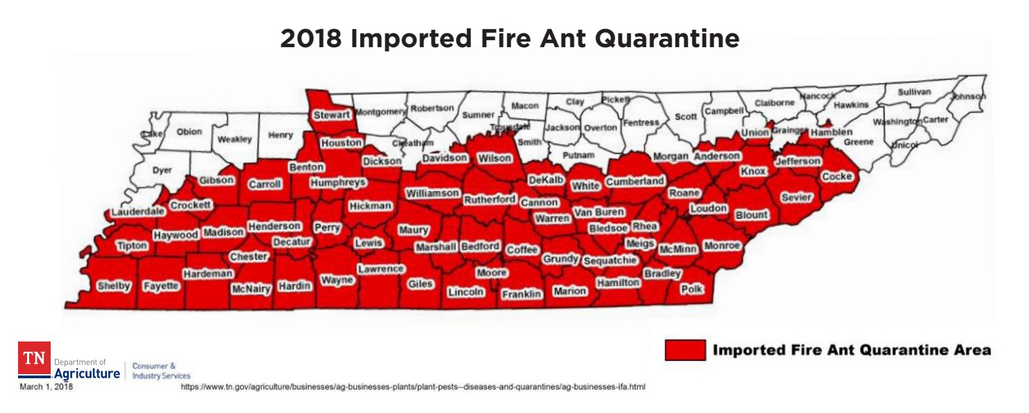
Figure 1. The Tennessee areas quarantined for imported fire ants in 2018 are indicated in red. A list of quarantined areas by county can be found at <u>fireants.utk.edu/resources/updates.html</u>.

which may harbor IFA. Tennessee areas under the IFA quarantine have expanded during the last three decades and in 2017 covered more than 17.8 million acres or slightly more than 67% of Tennessee's land area. About 4.7 million Tennesseans, or 70% of the state's population, live in infested counties and are affected by fire ants. The hybrid has extended its range westward into traditionally black IFA-infested areas and now dominates in East and Middle Tennessee with the black most common in the west (Figure 2). We expect the hybrid, which is more cold tolerant than the red or black species, to eventually dominate the Tennessee IFA distribution. Although the red IFA is found throughout the southeastern U.S., it is rare in Tennessee. The largest red IFA population is found in an isolated pocket in Williamson/Davidson County.