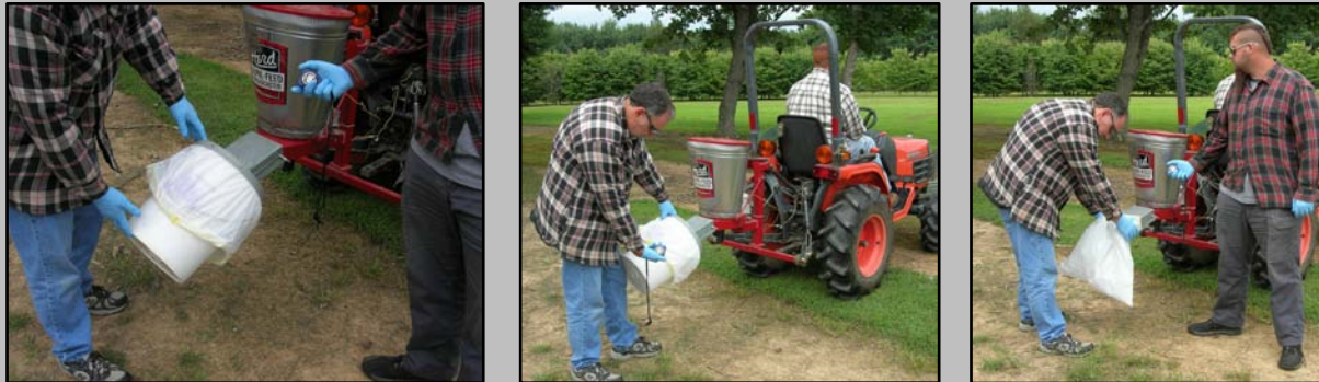
Fig. 8. Left photo: Capturing bait from a Herd® GT-77 spreader using a bucket with a slotted lid with an assistant timing the collection. Middle photo: The bucket collecting method also allows a single person to both collect and time the collection using their leg to keep the bucket in place. Right photo: Holding a collection bag directly on the chute attachment without a bucket. Note that two hands are required to hold the bag in place and that a second person is needed to time with this method.

Step 5 (continued): Collect bait from the spreader for the same amount of time it took to drive the 100 feet driving course (see Step 2) (Fig. 8).