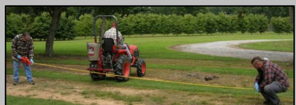
Fig. 4. Measure the bait spreader swath width.

Step 4. Run the spreader for a few seconds and measure the width of the bait swath distributed by the spreader (Fig. 4). The edge of a cultivated field or a nursery row are good locations to calibrate because the bare soil allows you to see the bait particles.