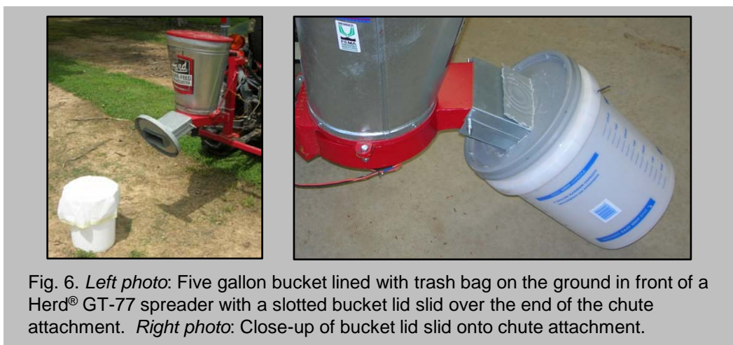
Fig. 6. Left photo: Five gallon bucket lined with trash bag on the ground in front of a Herd® GT-77 spreader with a slotted bucket lid slid over the end of the chute attachment. Right photo: Close-up of bucket lid slid onto chute attachment.