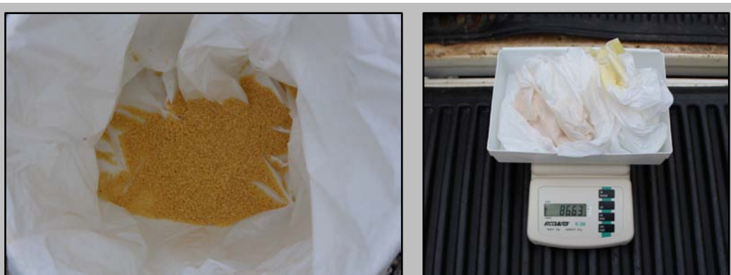
Fig. 9. Left photo: Bait collected in trash bag. Right photo: Trash bag with bait weighed inside a plastic pan on a scale.

Note: It is not necessary to empty the bait collection bag if you need to capture more bait for additional calibration, because you can subtract the difference of each successive bait collection from the weight of the previous collection to determine how much bait you are capturing at each collection event.