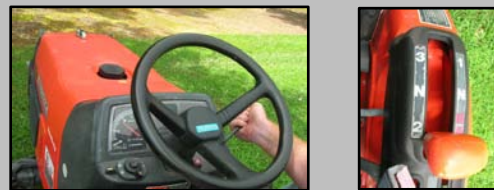
Fig. 3. Left photo: Moving the throttle lever on a tractor by hand to increase or decrease engine speed (RPM) on the tachometer. Right photo: Multiple gear and high/low options are typical of most tractors.

Step 3 (Optional but suggested): It will be helpful to measure travel times for multiple gear and engine speed settings to facilitate later calibration steps.