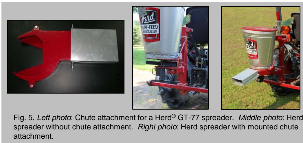
Fig. 5. Left photo: Chute attachment for a Herd® GT-77 spreader. Middle photo: Herd spreader without chute attachment. Right photo: Herd spreader with mounted chute attachment.

Step 5: Bait must be collected from the spreader to determine output rate. Some spreaders like the Herd® GT-77 have a chute attachment that facilitates collecting bait for calibration (Fig. 5). A five-gallon bucket lid with a slot cut large enough to fit over the chute opening is an excellent way to collect bait (Fig. 6). A plastic bag can be placed inside the bucket to catch the bait to facilitate the subsequent weighing. Other spreaders like the Vicon can have a plastic bag zip-tied to the dispensing spout to collect the bait (Fig. 7)