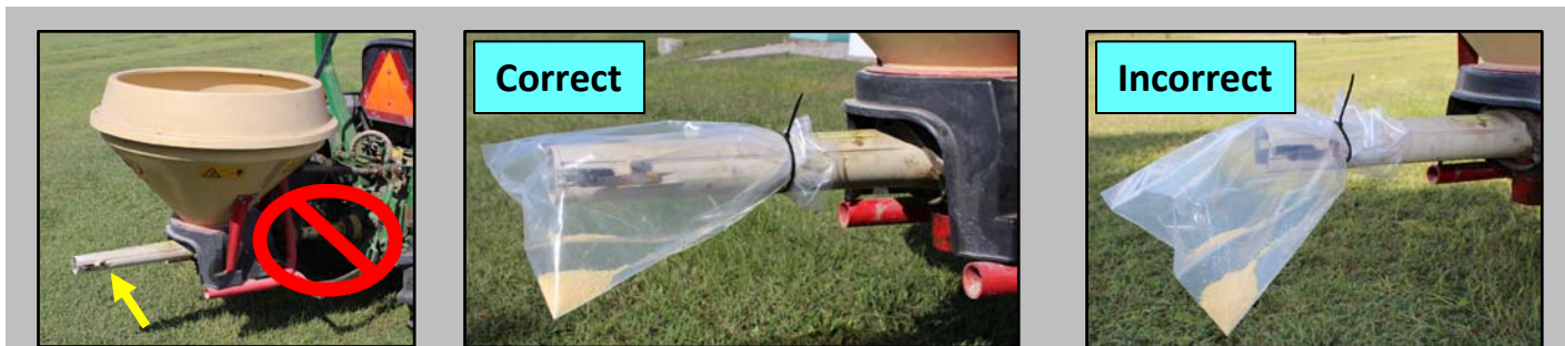
Fig. 7. Left photo: Vicon spreader with detachable spout attachment (see yellow arrow). Do Not go anywhere near the Vicon PTO shaft on the opposite side of the spreader during operation (see red circle with slash). Rotating PTO's Can Be Lethal. Middle photo: Spout attachment with a plastic bag zip-tied to the dispensing spout to catch bait. A bag with thicker plastic (i.e., heavier mil) works best because the moving spout will rub a hole in the bag over time. Note that the plastic bag has been slid onto the spout so that there are only a couple of inches of bag from the end of the spout opening. Do Not go near the swinging spout attachment during operation. Right photo: Plastic bag attached too far back on the spout attachment, which results in bag twisting when the spout is swinging side to side.