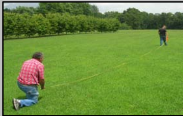
Fig. 1. Marking a driving course with a measuring tape.

Step 1: Measure a 100 foot long driving course (Fig. 1).